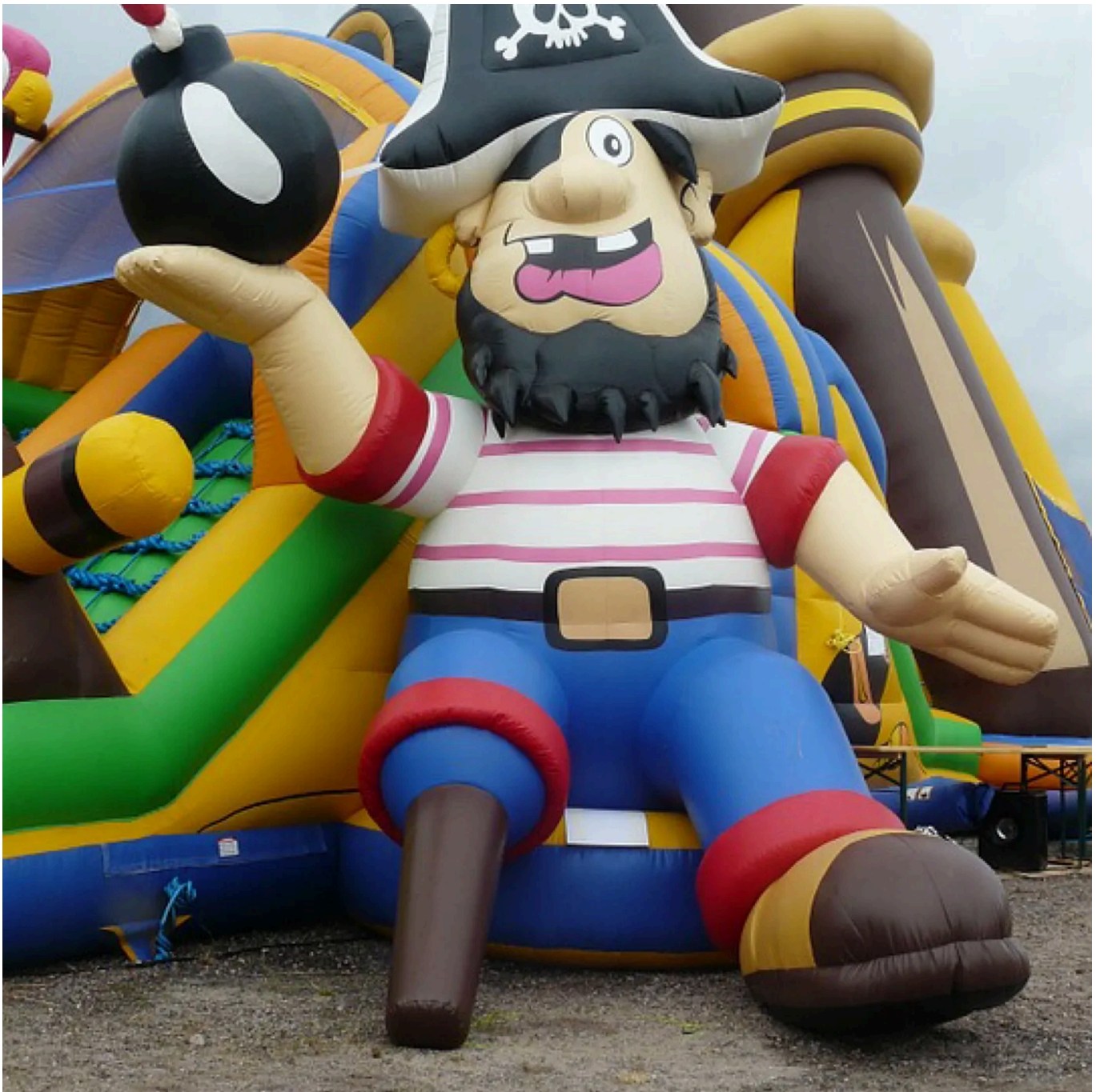
Cap'n Peril's: A place for celebratin' danger!

AHOY!! Welcome to Cap'n Peril's Pirate Pizza Parlor*, a place for celebratin' danger! Where ye be findin' over 10,000 square feet of inflatable pirate ship merrymakin', accompanied by mouth-waterin' pizza! ARRRR!!! Since new gun-friendly decrees allowed us to add a shootin' range onsite, we bin makin' some changes, and changes to our waiverr be in ALL CAPS, mateys! We never bin a sword-free zone, and now we'll never be a gun-free zone, ye lily